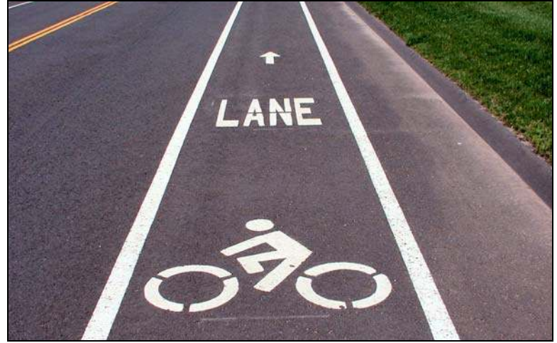
Multi-Modal Transportation Needs