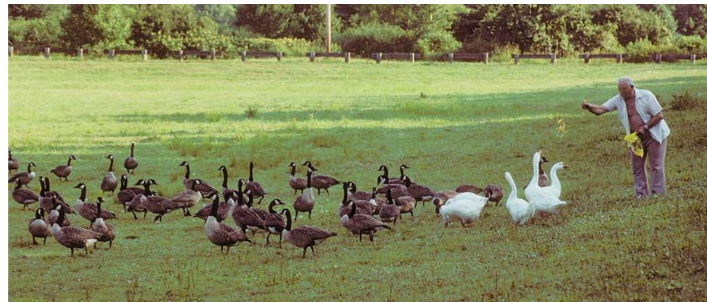
Feeding waterfowl concentrates birds and increases their susceptibility to diseases, such as avian cholera and avian influenza (bird flu).

Support Connecticut's natural waterfowl habitats by purchasing a Connecticut Duck Stamp or becoming involved in organizations and/or projects that acquire, preserve, protect, and restore our state's coastal and inland wetlands.