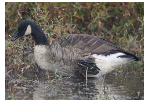
People who feed waterfowl contribute to the birds acquiring numerous physical ailments that result from malnutrition.

private landowners often spend large amounts of money to alleviate problems with waterfowl that are often caused by people feeding these birds. By not feeding waterfowl, you are allowing the birds to use our state's natural areas to our benefit and theirs.