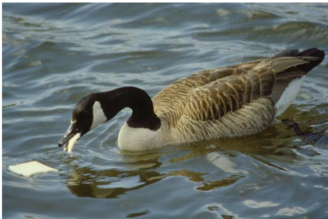
Processed foods lack the nutrients waterfowl need for survival.

Connecticut provides important breeding and wintering habitat for approximately 30 waterfowl species. Our state abounds with numerous coastal and inland areas that are very important to ducks and geese.