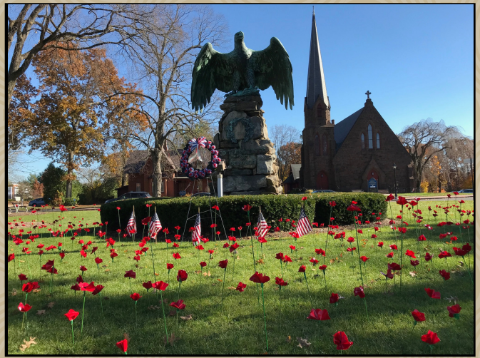
Social Studies students from Windsor High School decorated the "Eagle Green" with poppies in honor of the 100th anniversary of World War I.