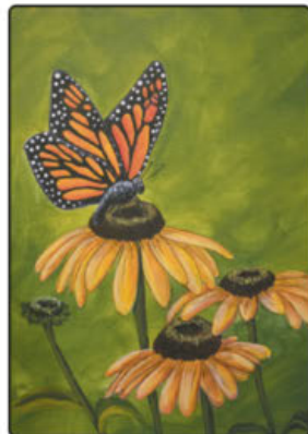
August 15th painting