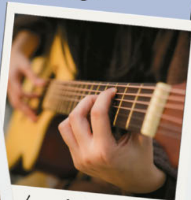
Learn Guitar on Mondays with Marc!

9:00 Pickleball - Adv. Play 9:00 SS BOOM Muscle 9:00 Cribbage 10:00 Yoga 10:30 SS Classic 10:30 Parkinson's Support (*3rd Wed.) 10:30 Bereavement (closed group) 11:45 CRT Lunch 12:30 Quilting (*2nd & 4th Wednesday)