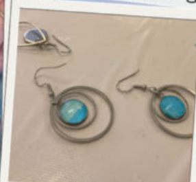
go home with four paintings and new jewelry! see page 5