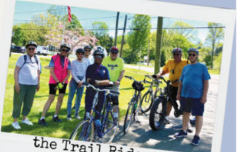
the Trail Riders out enjoying a ride